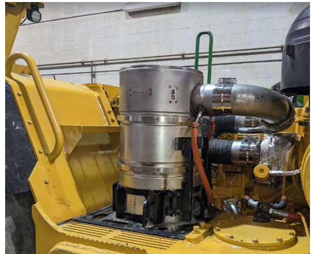
Mining CRT: DOC + DPF + NO 2 DeComp filtration for low NO 2 with superior CO and DPM reduction

Johnson Matthey was first to develop and patent CRT technology. We have been innovating diesel emission control systems for 25 years and no other supplier can match our experience.