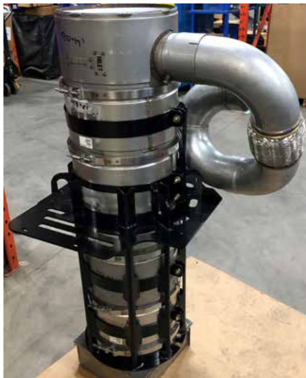
Mining CRT system